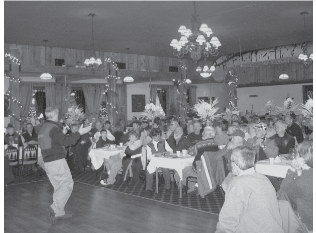
2006 Annual Birchleggings Breakfast in Hayward

We are looking forward to seeing you at the race and our awards event.